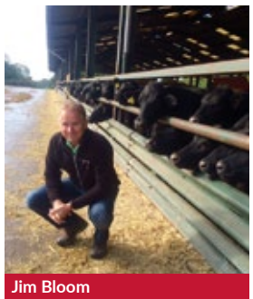
Founder, Warrendale Wagyu

(by 31 March at latest, please) – after which one of our team will get in touch to confirm arrangements.